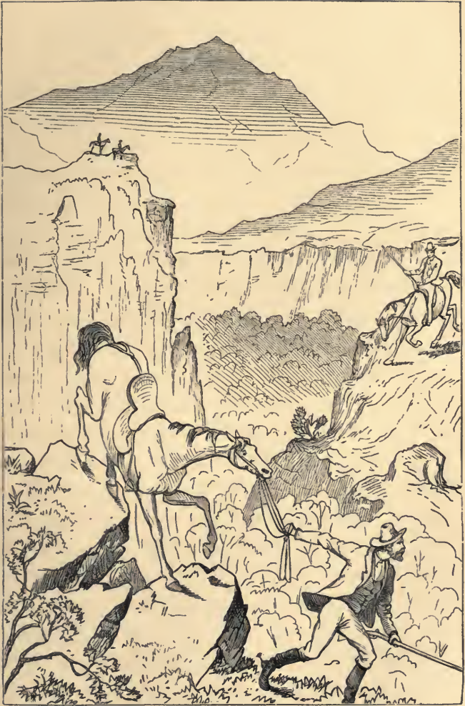
HUNTING THE BAVIAANS RIVER MOUNTAINS.—PAGE 126.